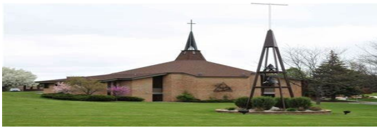
Caro United Methodist Church 670 W Gilford Rd, , Caro, MI 48723