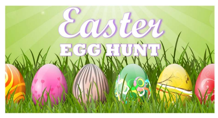
Join us at 12:30 pm for our joint Cass City & Caro UMC Easter Egg Hunt.