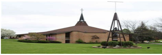
Caro United Methodist Church 670 W Gilford Rd, , Caro, MI 48723