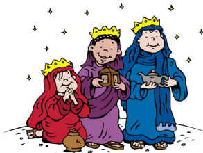
Children's Christmas Program

Sunday December 3rd after worship service, we will be having a potluck and then we will be decorating (Hanging of the Greens). Please Join us if you can as the Advent Season Begins.