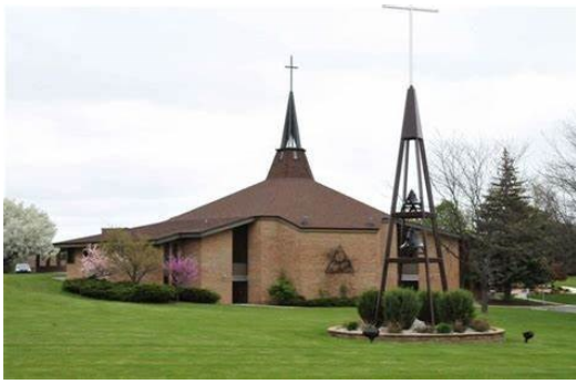
Caro United Methodist Church 670 W Gilford Rd, , Caro, MI 48723